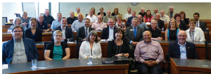
The AMO Board and AMO Staff at the June 2013 Board Meeting