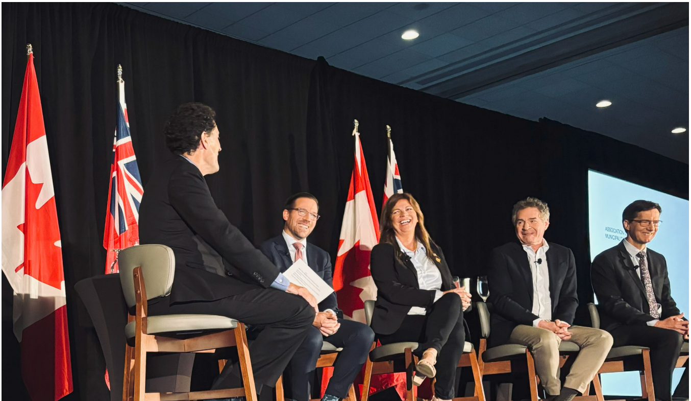
AMO Annual Conference 2024, Plenary Presentation, "Thinking Differently about Infrastructure"

AMO membership engagement continued to grow in 2024 as the AMO Conference in the City of Ottawa broke a number of records.