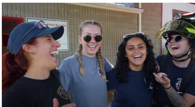
AMO's Municipal Workforce Development Project Roadmap

In 2024, AMO advanced this work with the release of Careers that build communities: AMO's Municipal Workforce Development Project Roadmap . The roadmap is informed by the Municipal Employee Survey, which gathered input from more than 30 municipal CAOs and HR professionals, as well as nearly 2,400 municipal employees. It identifies five key priorities to strengthen municipal workforce capacity through improved recruitment, retention, and talent development. To support this, AMO began work on a public affairs campaign designed to shine light on careers in local government. AMO is also expanding partnerships with post-secondary institutions and professional associations to support this work through joint research, advocacy, and programming.